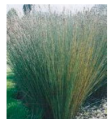
Apodasmia similis.