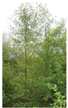
Plagianthus regius.