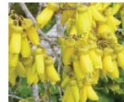
Sophora chathamica.