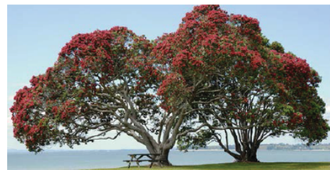
Metrosideros excelsa.