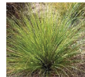
Carex virgata.